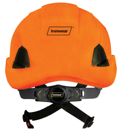
(Back with Ratchet)