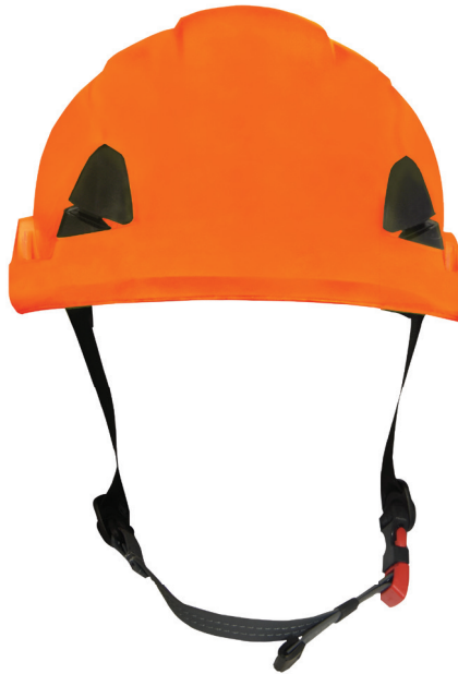
(Front with Chin Strap)